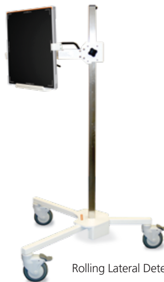
Rolling Lateral Detector/Cassette Holder