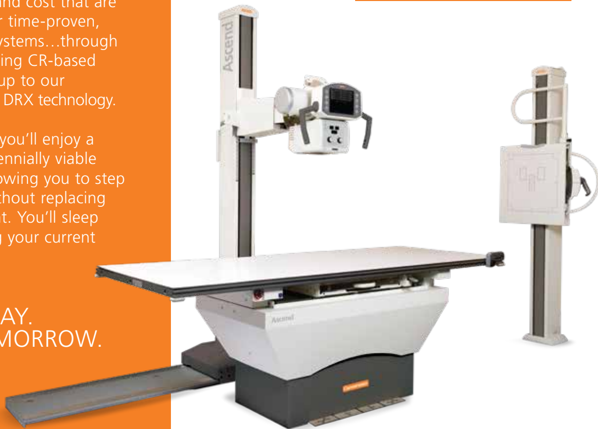
DRX-Ascend with Floor-Mount Tube