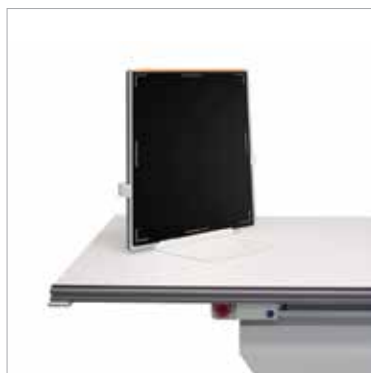
Tabletop Detector/Cassette Holder