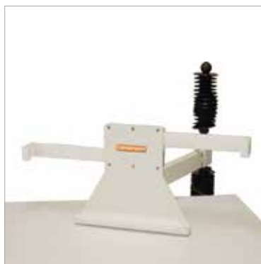
Lateral Detector/Cassette Holder